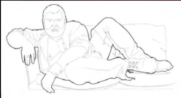
"Winter" , from the 4 seasons series

Indian ink on white cardboard, Ecoline watercolour, white chalk, white pencil.