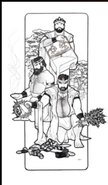
"The 3 Kings"

Indian ink on white cardboard, Ecoline watercolour, white chalk, white pencil, digital colours.