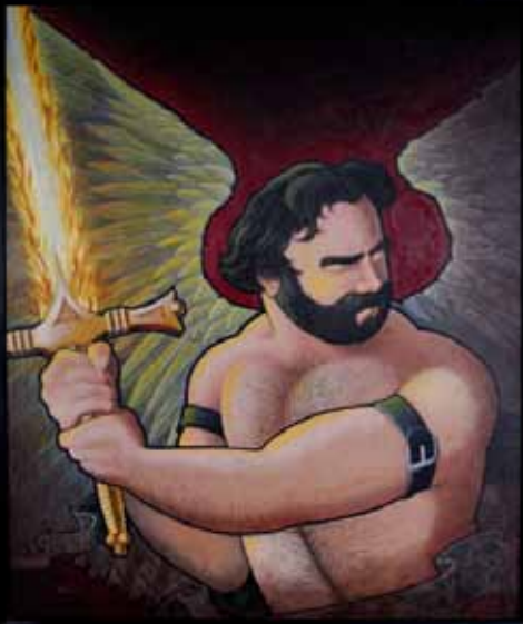
"St Michael" Acrylics on canvas 60cm x 50cm