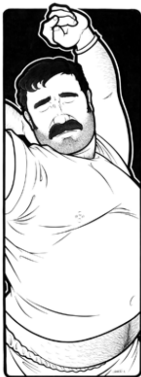
"Dusk & Dawn", dyptich.

Indian ink on white cardboard, Ecoline watercolour, white chalk, white pencil, digital colours.