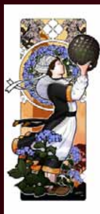
"The fisherman's daughter"